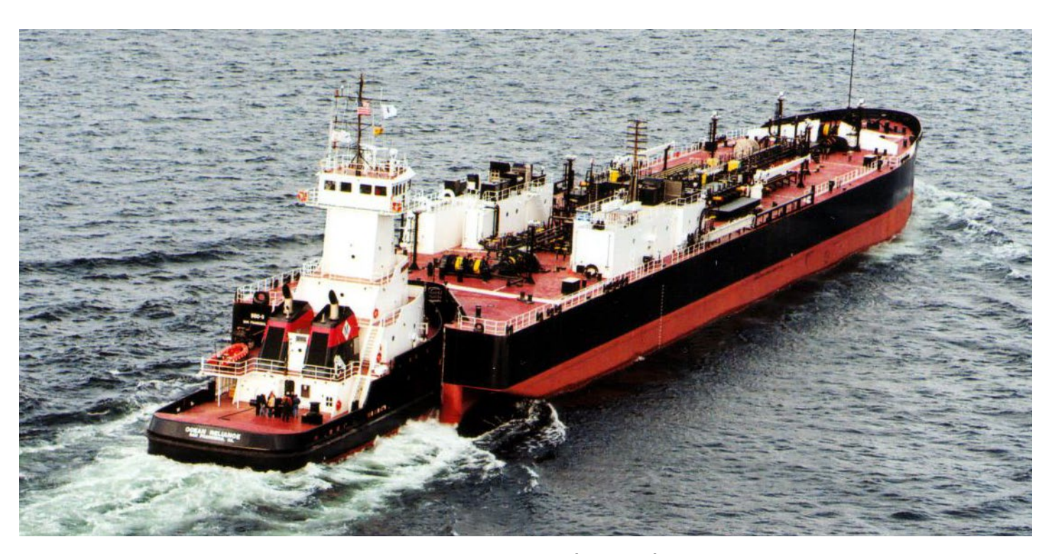
An articulated tug and barge (ATB). This example is 480 feet long, 18,000 DWT, and can carry 6.7 million gallons of oil.