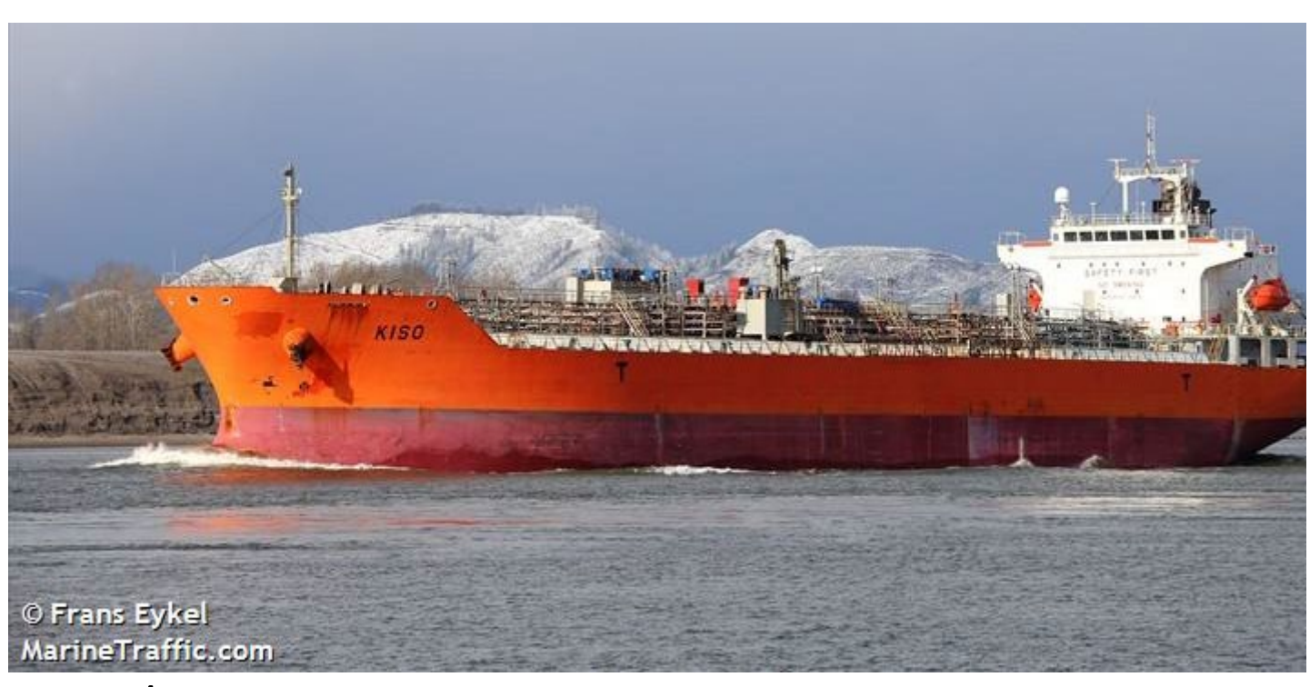
An oil/chemical tanker. This example is 557 feet long, 33,600 DWT, and can carry 10 million gallons of oil.